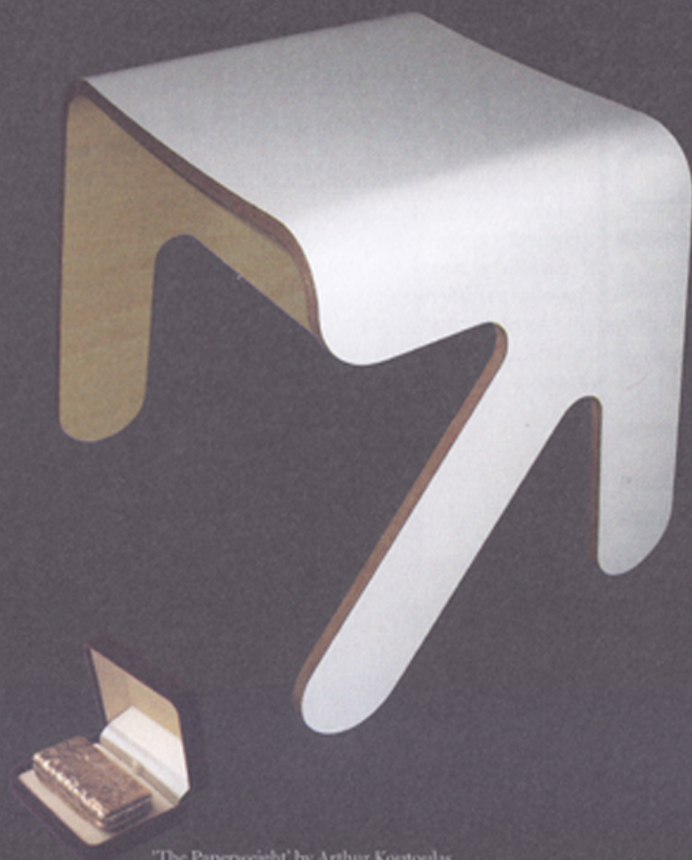
‘The Paperweight’ by Arthur Koutoulas